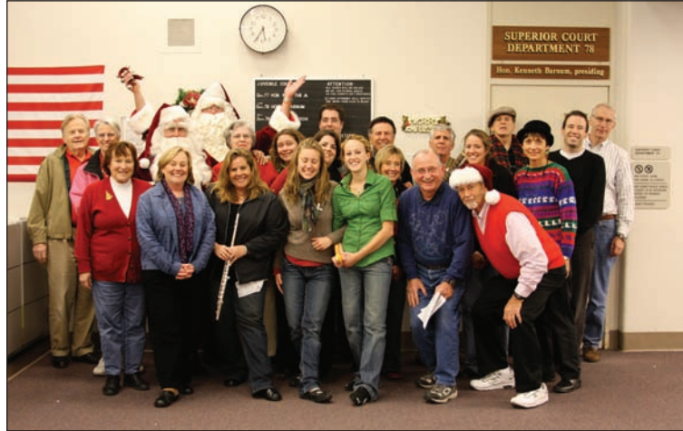
Santas 1, 2, and 3 and their Elves