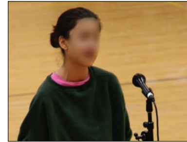
A young woman sings the song she wrote to an NSync melody.