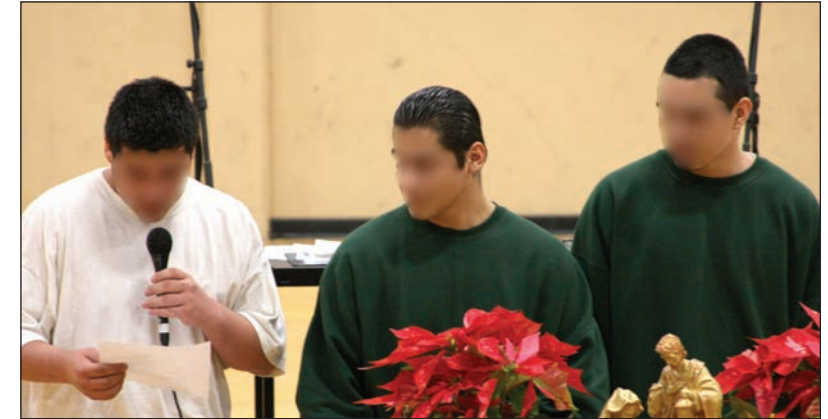
Three minors read from the scripture during the holiday service.