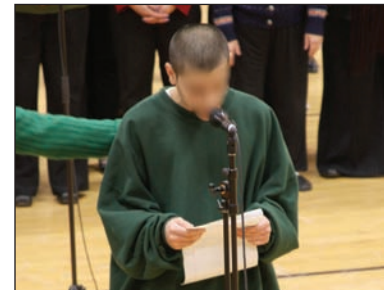
A young man reads a Christian rap that he wrote for this special night.