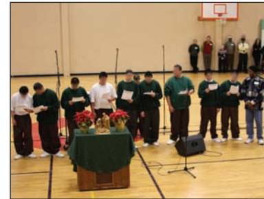
The JH choir started off the evening