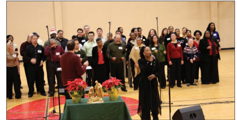
The talented and animated Abundant Life Christian Fellowship choir from Mountain View sang an array of Christmas songs.